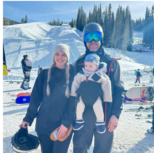
Pictured: Skiing with the Family

Favorite Quote: “Everyone has a plan until they get punch in the mouth” - Mike Tyson