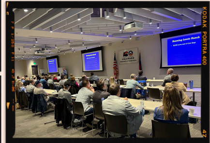
Potpourri in May