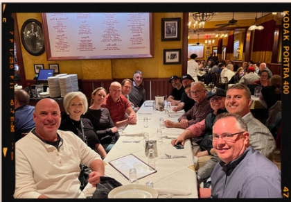
LDAC Group Dinner